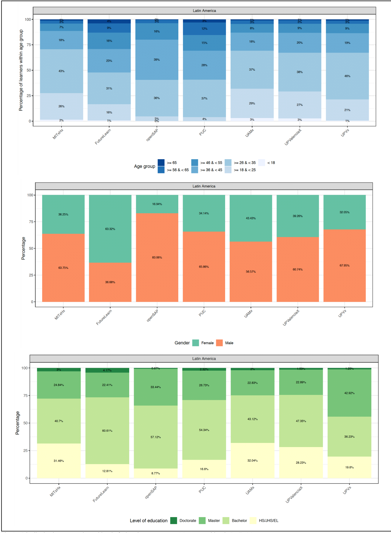
Fig. 1. Distribution by age, gender and level of education across seven MOOC providers in LATAM